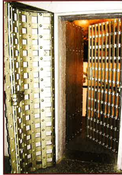
ENTRANCE TO THE CELL BLOCK

The Old Jail was a place where a debt society was served. Both accused and convicted individuals would make their home here until the jail was turned into a museum in 1968. The sheriff's quarters were housed in the front of the building, while the inmates were located in the back section.