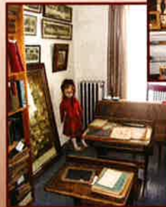
19TH CENTURY SCHOOL ROOM